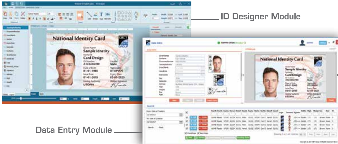
ID Designer Module